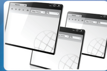
Web Front End